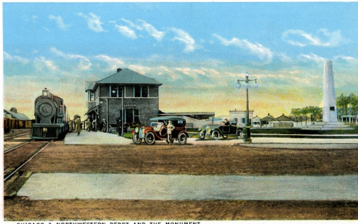
CHICAGO & NORTHWESTERN DEPOT AND THE MONUMENT.

in 1868, starting train service to Wyoming. Twenty years later, the Fremont, Elkhorn and Missouri Valley Railroad